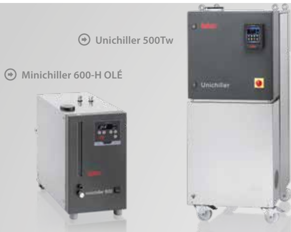
⇒ Unichiller 500Tw