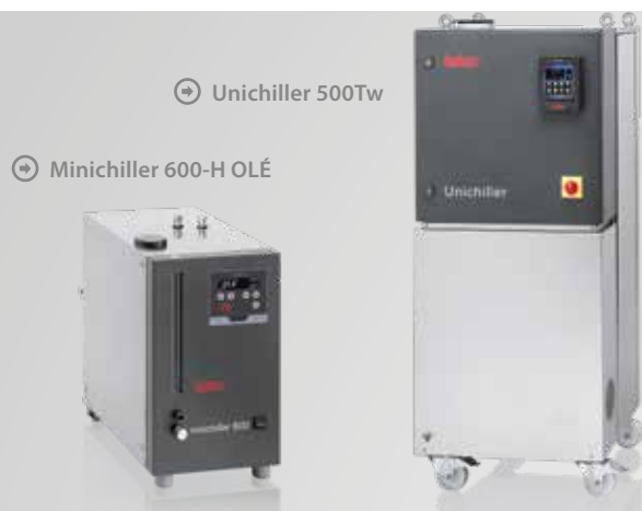
⇒ Unichiller 500Tw