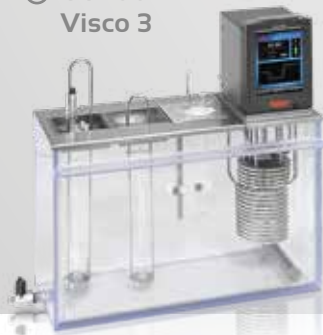
⊕ CC-130A Visco 3

The recrystallization of cannabinoids is most commonly done within a jacketed reactor. In order to maximize productivity, precise and responsive temperature control is essential. Automation is easily attainable with the Pilot ONE programmer allowing for custom cycles and temperature ramps to be created, and if required, saved onto a USB thumb drive. With the Unistat series, isolate production has never been easier or more efficient. Operators most commonly use the CC-508, Unistat 410, or Unistat 525 for these processes.