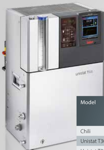
➔ Unistat T305